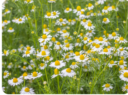
Daisies grow in meadow habitats.