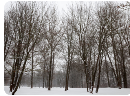
deciduous trees in winter

Trees can be deciduous or evergreen. Deciduous trees lose their leaves in autumn and have bare branches in winter. Evergreen trees shed old leaves and grow new leaves all year round, which means they keep their leaves in winter.