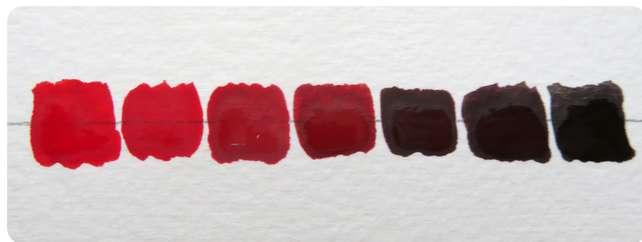
shades of red

A shade is a colour mixed with black. The more black paint that is added to the original colour, the darker the shade. A shade can range from slightly darker than the original colour, to nearly black. When mixing a shade, begin with the pure colour and add black paint a tiny bit at a time.