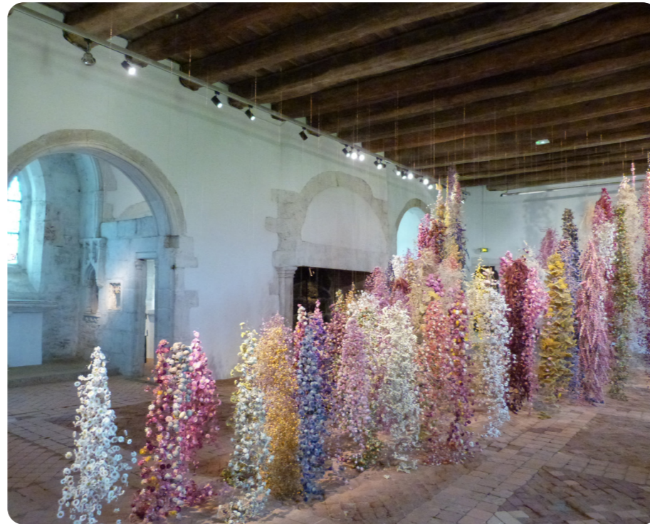
Banquet by Rebecca Louise Law, 2019

Some land artists bring materials inside from the outdoor environment to create installations in galleries and exhibition spaces.