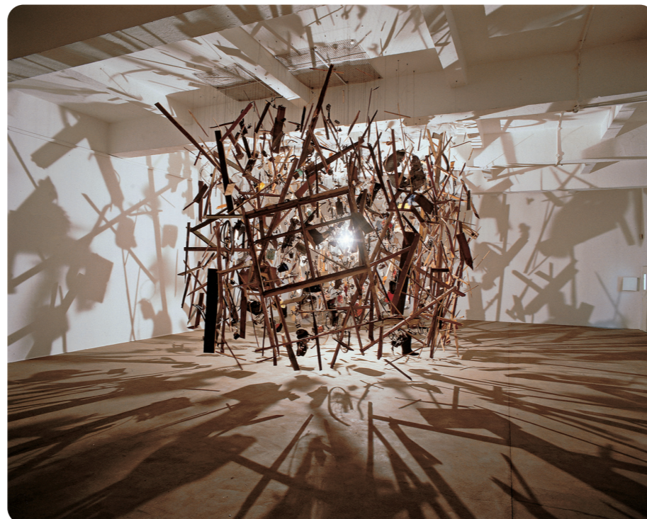
Cold Dark Matter: An Exploded View by Cornelia Parker, 1991