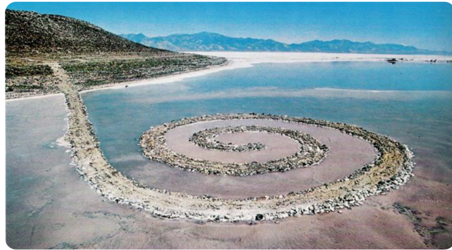
Spiral Jetty by Robert Smithson, 1970

Land art, or Earth art, is art that is made within the landscape. Land art is usually captured using photography because it is temporary and often made on a large scale.