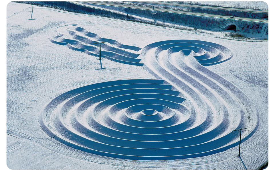
Earth Sign by Wilhelm Holderied, 1995

A relief sculpture projects from a flat surface. A high relief sculpture clearly projects out of the surface and looks like it is freestanding. A low relief, or bas-relief, sculpture does not project far out of the surface and is visibly attached to the background.