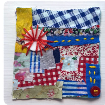
Photo collages and surrealism

Scraps of fabric, or fabric crumb, can be used to make abstract fabric collages. The fabric crumb is glued onto a piece of backing fabric, using techniques, such as layering to add interest. Fabric collages can be embellished with buttons, sequins or embroidery stitches.