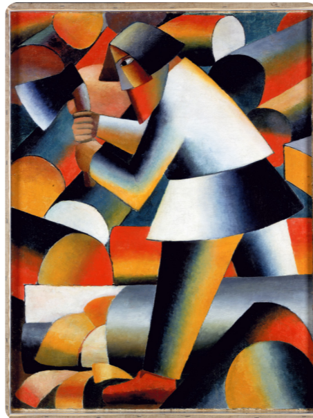
Some artworks reduce their subject matter to basic shapes, such as The Woodcutter by Kazimir Malevich.