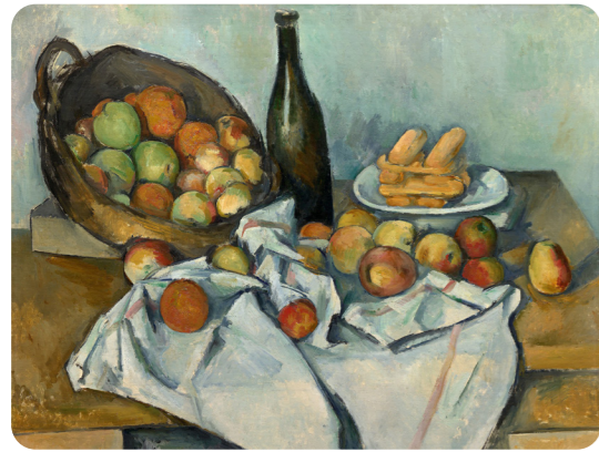
The Basket of Apples by Paul Cézanne, 1893–1895

A still life is an artwork showing an arrangement of everyday objects. Paul Cézanne and Vincent van Gogh are famous still life artists.