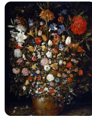
Jan Brueghel the Elder painted large flowers at the top of the vase and small ones at the bottom.