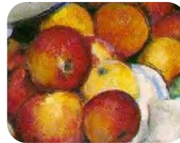
Paul Cézanne painted these apples in bold, warm colours.

Artists choose colours carefully. They decide whether to use warm or cool colours and think about how those colours make people feel.