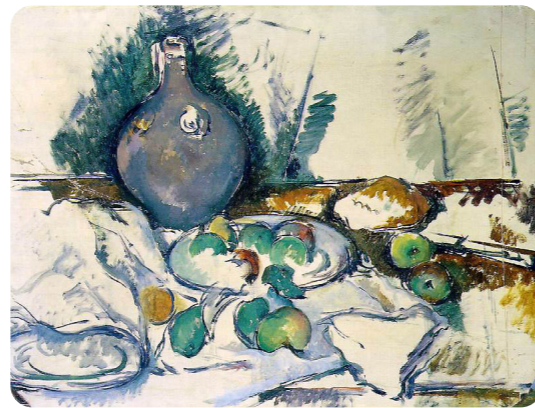
Paul Cézanne painted the apples in the foreground and the jug in the background in this painting.

Artists arrange objects in their artworks carefully. They decide which objects will go in the foreground or background of the work. They also think about the size of the objects they have chosen.