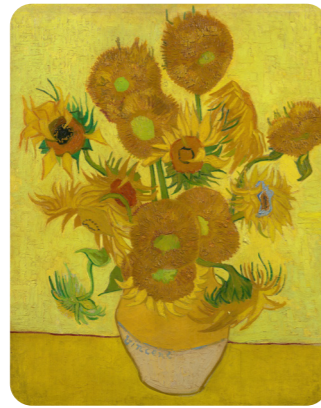
Vase with Fifteen Sunflowers by Vincent van Gogh, 1888