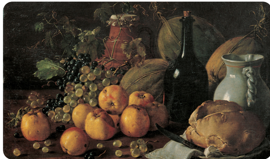
Luis Meléndez used a selection of natural and man-made objects in this painting.

Still life artwork shows a selection of objects. They can be natural or man-made. Food, flowers, shells and skulls are popular natural objects. Vases, bottles, books and candles are common man-made objects.